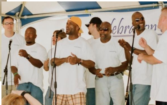
The IFI choir leads in worship